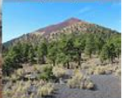
Sunset Crater, Arizona