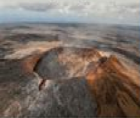
Mauna Loa, Hawaii