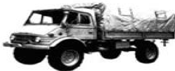
G 415 4x4