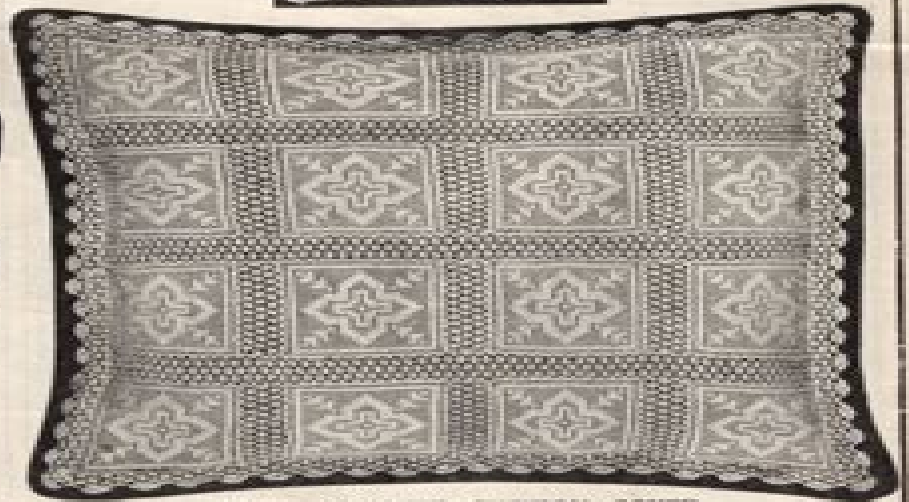
FILET CROCHET CUSHION COVER.

CAUTION. —The Illustrations and Letterpress in this Magazine are Copyright; the Publishers reserve all rights of Reproduction. WELDON'S, Ltd., Fashion Publishers, 30 to 32, Southampton St., Strand, London, W.C., and all Newsagents and Fancy Repositories.