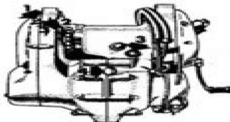
550, T50 Twinn