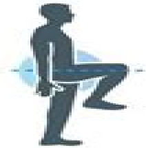
Single Leg Balance