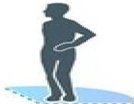
Lower Quarter Rotation