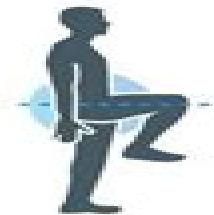
Single Leg Balance