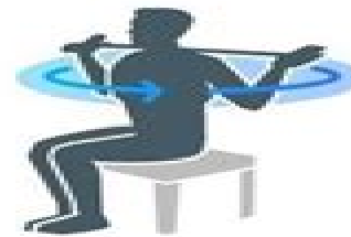
Seated Trunk Rotation