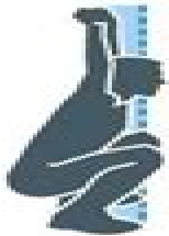
Overhead Deep Squat