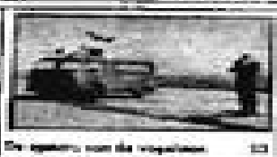
De achtergrond van de seizoenen