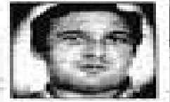
De man op de foto is de presentator van de nieuwsbrief.