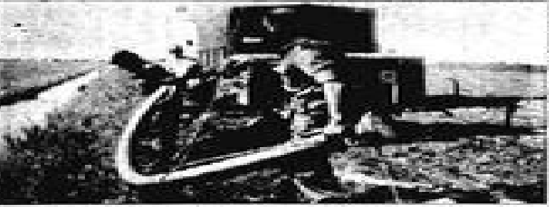
De pompen worden gebruikt om water te pompen uit de grond. Dit is een belangrijke maatregel om de droogte te bestrijden.