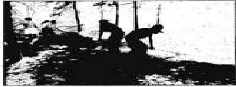
Brandweerlieden bestrijden bosbrand in de omgeving van de Dordrechtse Bos. De brand is nu onder controle. De brandweer heeft de brand gestopt. De brandweer heeft de brand gestopt.