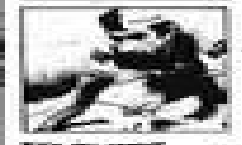
De foto toont een kind dat aan het spelen is.

De foto toont een kind dat aan het spelen is. Het kind lijkt te genieten van de activiteit.