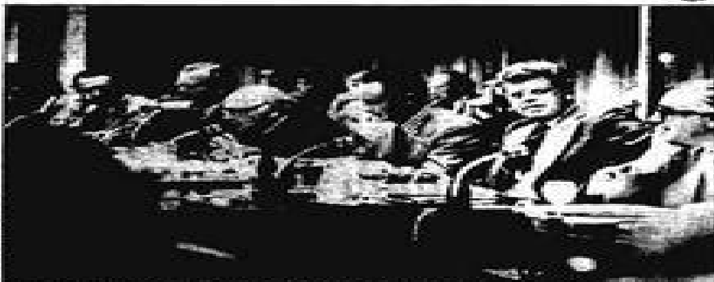
Minister van Arbeid, Minister van Financiën, Minister van Justitie, Minister van Landbouw, Minister van Onderwijs, Minister van Overige Zaken, Minister van Volksgezondheid, Minister van Verkeer, Minister van Water, Minister van Woningbouw, Minister van Zaken van het Koninkrijk.

Voor een nieuw kabinet Kabinetvoorstel van Minister van Arbeid De Minister van Arbeid heeft een voorstel gemaakt voor een nieuw kabinet. Het kabinet zal bestaan uit de volgende leden: Minister van Arbeid, Minister van Financiën, Minister van Justitie, Minister van Landbouw, Minister van Onderwijs, Minister van Overige Zaken, Minister van Volksgezondheid, Minister van Verkeer, Minister van Water, Minister van Woningbouw, Minister van Zaken van het Koninkrijk.