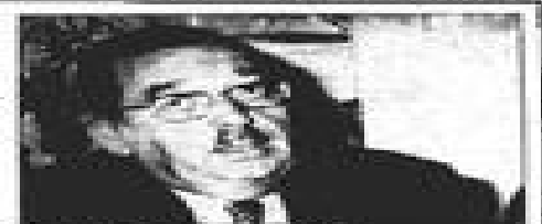
Jan Tinbergen, 80 jaar oud

De minister van Financiën heeft in zijn voorjaarsnota aangekondigd dat de Nederlandse Staat in 1987 met 2,3 miljard te weinig opbrengst aan belastingen zal innen. Dit is een belangrijke wijziging in de begroting. De minister heeft aangegeven dat de overheid hiervoor maatregelen moet nemen, zoals het terugkopen van aandelen en het verscherpen van de wetgeving op het gebied van de belastingen.