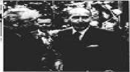
De Nederlandse ambassadeur in Warschau, Ciscard, wordt begroet door Poolse ambtenaren.