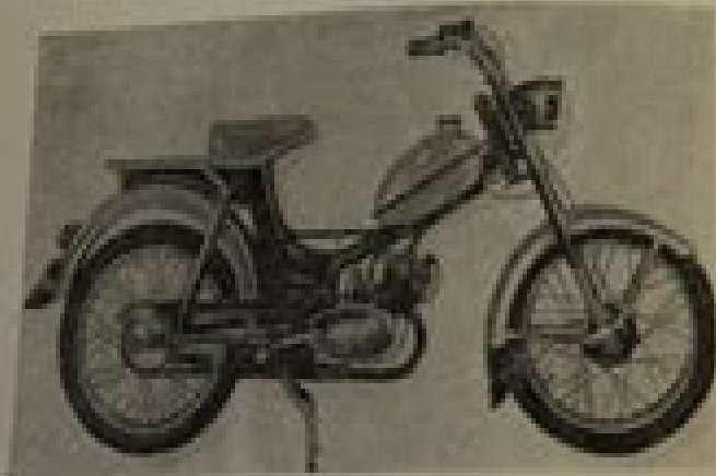
Fig. 1. Moped Moto-4

Since repairs are made essentially by fitting replacement parts, this manual covers the procedures for dismantling and reassembling individual units of the machine and gives fault finding instructions.