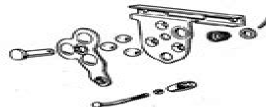
Clutch operating mechanism