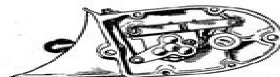
Clutch mechanism installed